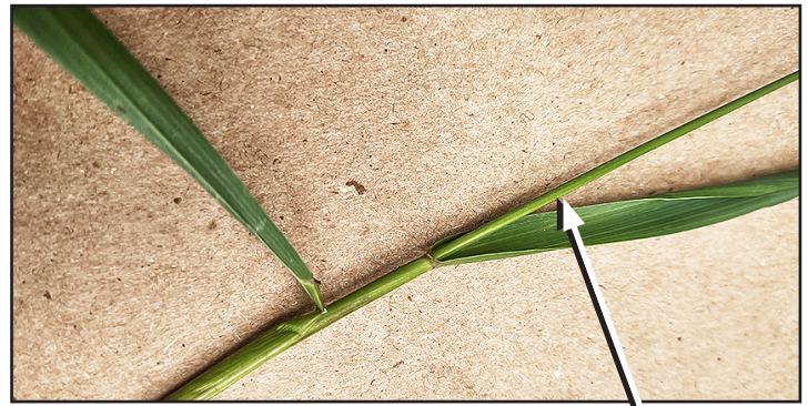
Rolled Emergent Leaf