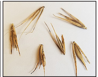
Examples of Different of Wild Rye Seeds