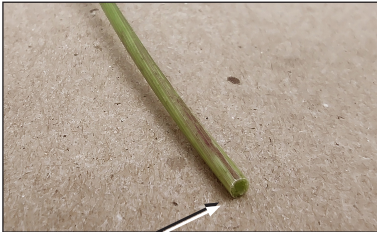
Rounded Tiller Base